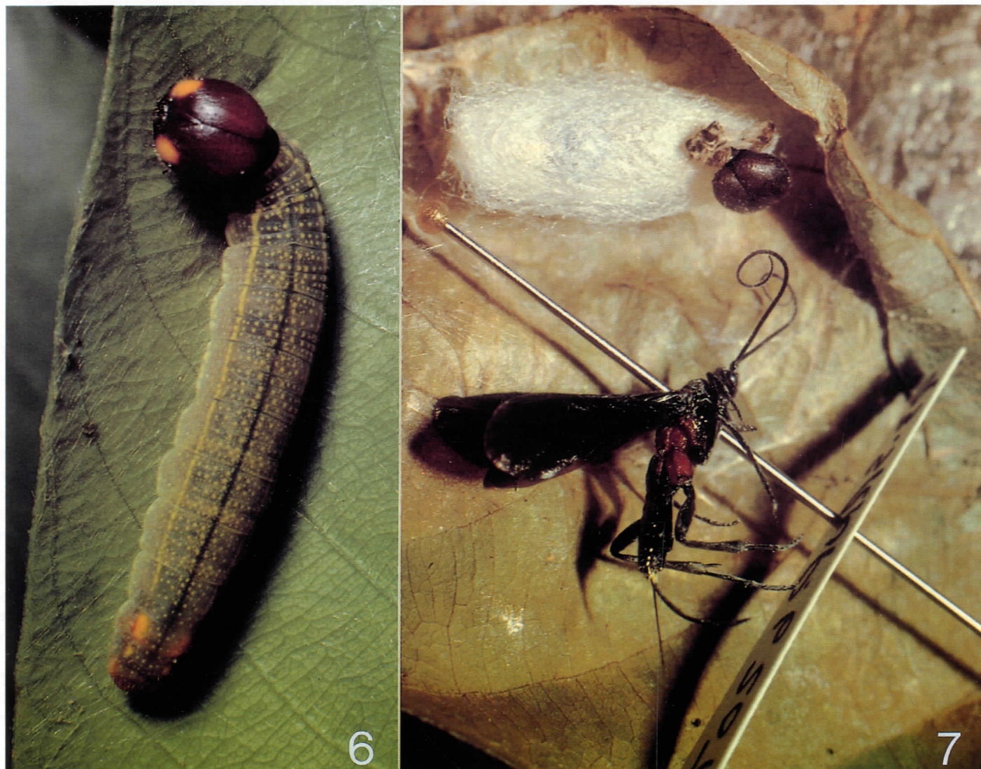
Fig. 6. Last instar larva of Urbanus esmeraldus (Butler) (Hesperiidae), a frequent host of the wasp Bassus brooksi (Braconidae) in the dry forests of the Area de Conservacion Guanacaste (voucher 90-SRNP-1906, Janzen and Hallwachs, 1998).