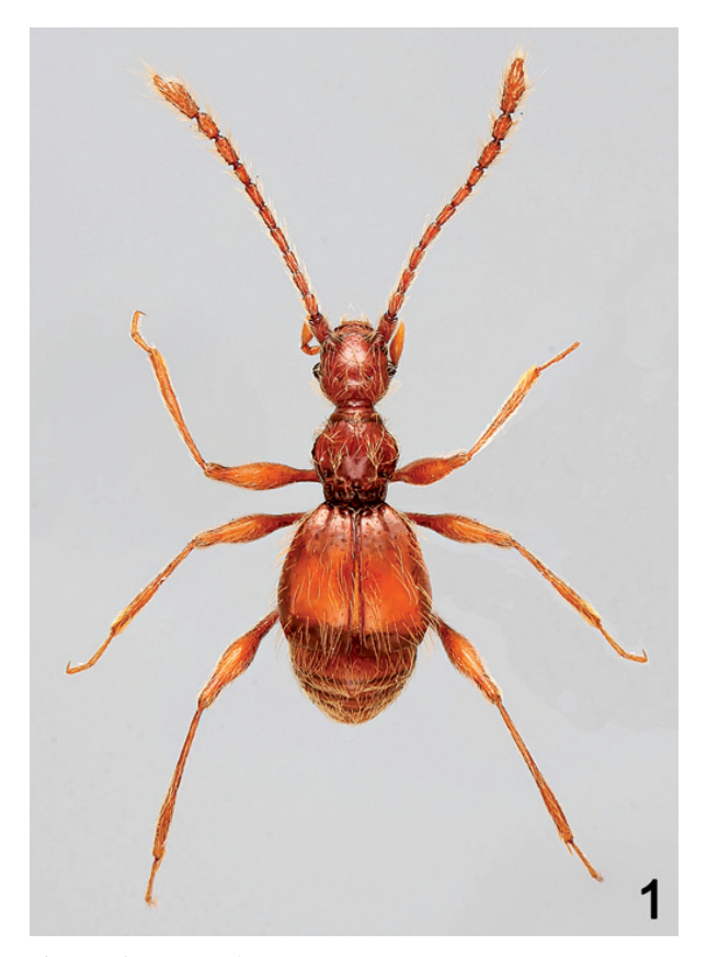
Figure 1. Habitus of Araneibatrus gracilipes gen. et sp. n.

1.25 times as long as VIII, slightly asymmetrical, widest near its middle; X slightly shorter but wider than IX, thickened, inner margin with distinct process; XI largest, about 1.8 times as long as X, narrowest at base, gradually widened toward its middle, then narrowed toward apex, lateral margin irregular with several small processes. Basolateral margins of antennomere II, VIII, IX, X and XI protuberant, forming tiny spine-like process (this character may only occur in males).