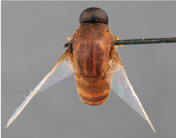
Figure 4. Quasi fisheri gen. et sp. n., male, dorsal view [Morphbank: 693077]. Body length = 6.0 mm.

rounded; posterior margin of eye rounded; eyes bare; three ocelli present, medial ocellus slightly smaller; position of antennae on head nearer to mouthparts; eyes contiguous above antennal base, not contiguous below; palpi absent; proboscis much shorter than head length; flagellum shape stylate, apex with terminal seta; thorax with postpronotal lobes enlarged, medially contiguous to form collar; subscutellum not enlarged, barely visible; legs with tibial spines absent; pulvilli present; legs not greatly elongated; wing hyaline, markings absent; costa ending in radial field; costal margin straight; humeral crossvein absent; radial veins meeting wing margin before wing apex; R_1 slightly inflated distally at pterostigma; R_{2+3} present, reaching wing margin; R_{4+5} present as very