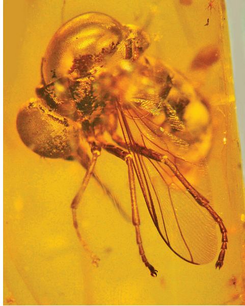
Figure 2. Eulonchiella eocenica Meunier (Baltic Amber). Body length = ca. 4.5 mm.

tapered and faint towards margin; cell m_3 absent; CuA_1 joining M_3 and petiolate, not reaching wing margin; CuA_2 fused to A_1 , not reaching wing margin, petiolate; abdomen smooth, shape rounded, cylindrical, similar width to thorax.