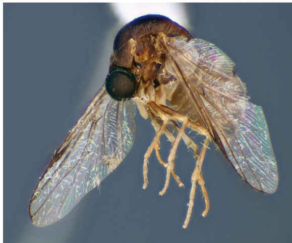
Figure 7. Schlingeriella irwini gen. et sp. n., female, lateral view [Morphbank: 693080]. Body length = 4.4 mm.