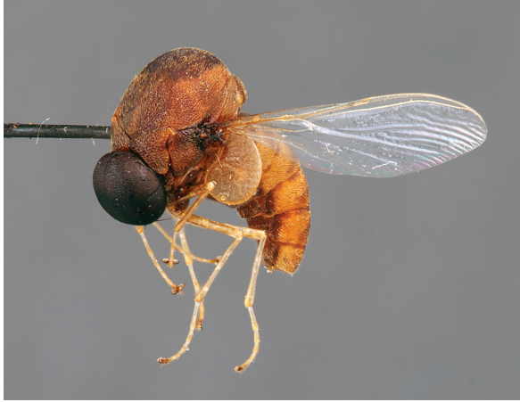
Figure 3. Quasi fisheri gen. et sp. n., male, anterolateral view [Morphbank: 693076]. Body length = 6.0 mm.