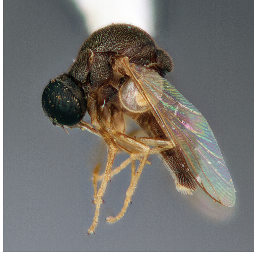
Figure 6. Schlingeriella irwini gen. et sp. n., male, lateral view [Morphbank: 693079]. Body length = 2.4 mm.