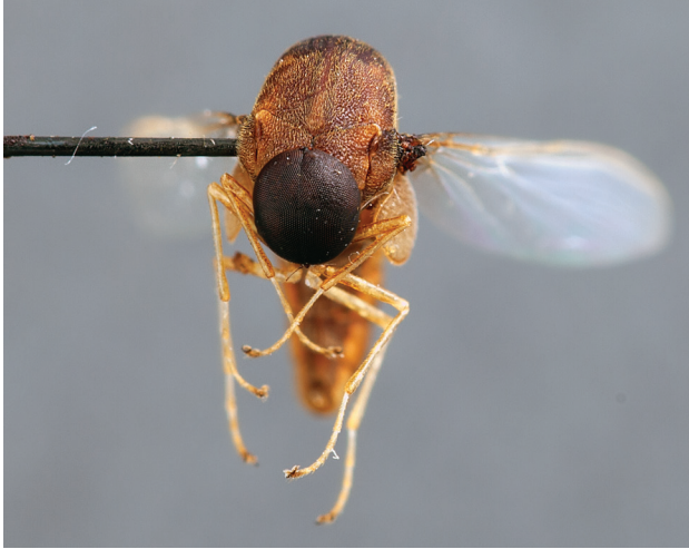
Figure 5. Quasi fisheri gen. et sp. n., male, anterior view [Morphbank: 693078]. Body length = 6.0 mm.

short, single vein, not reaching wing margin; medial vein complement with only one M vein present; discal cell absent; medial vein very short, not reaching wing margin; cell m_3 absent; crossvein 2r-m absent; Cu reduced, not reaching wing margin; anal lobe not enlarged; alula well developed; abdomen smooth, shape rounded, cylindrical, similar width to thorax.