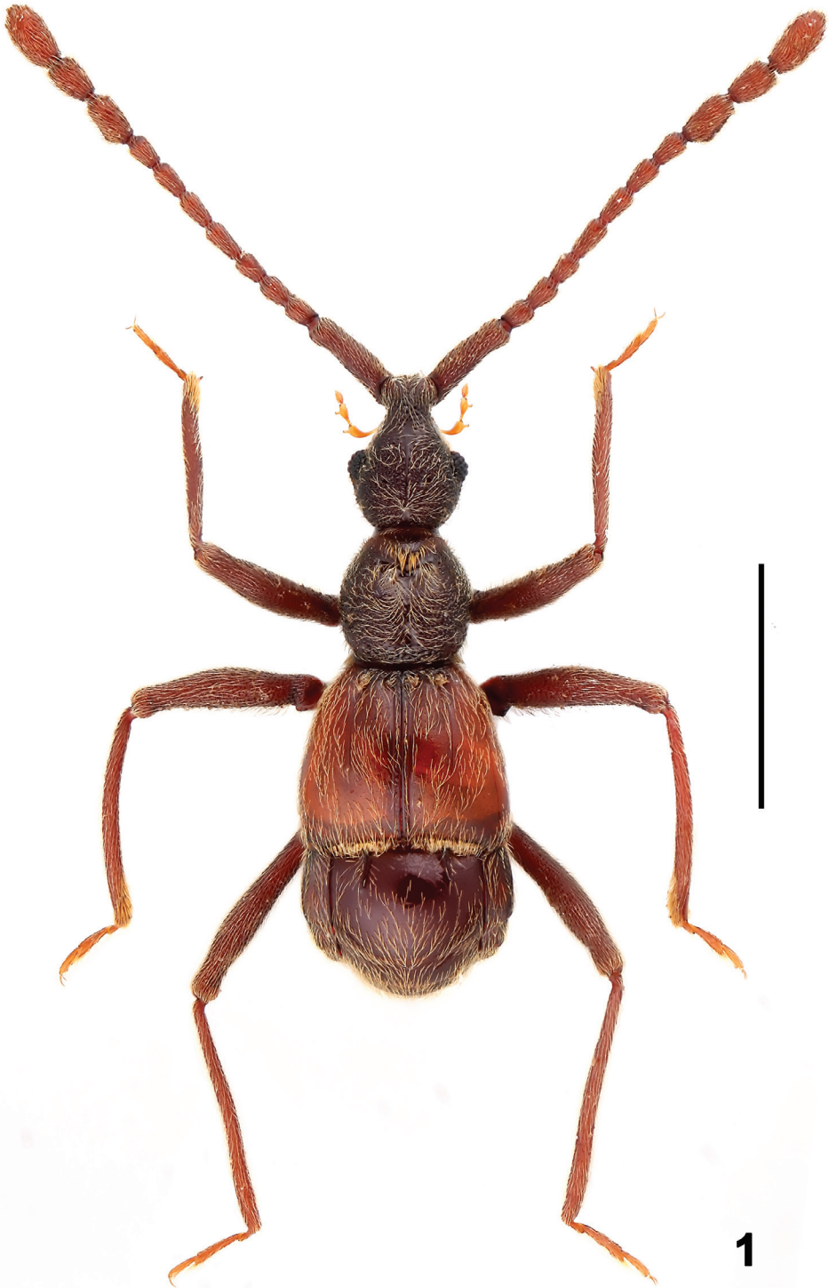
Figures 1. Male habitus of Dayao pengzhongi , holotype. Scale: 1.0 mm.