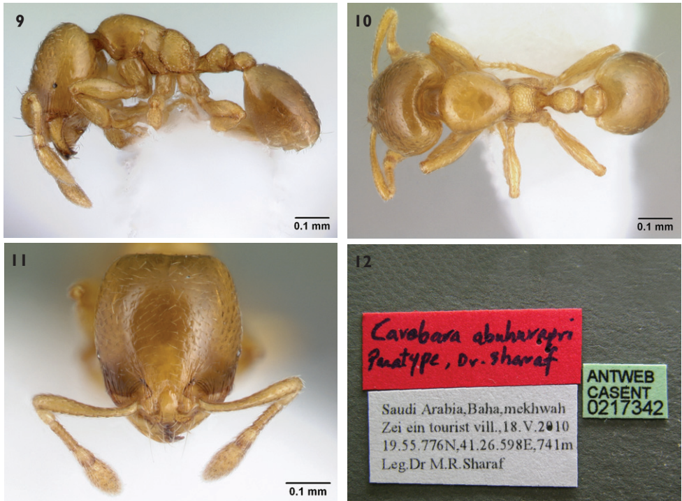
Figures 9–12. Carebara abuhurayri sp. n. paratype worker 9–12 , 9 body in profile 10 body in dorsal view 11 head in full-face view 12 type locality label (CASC)