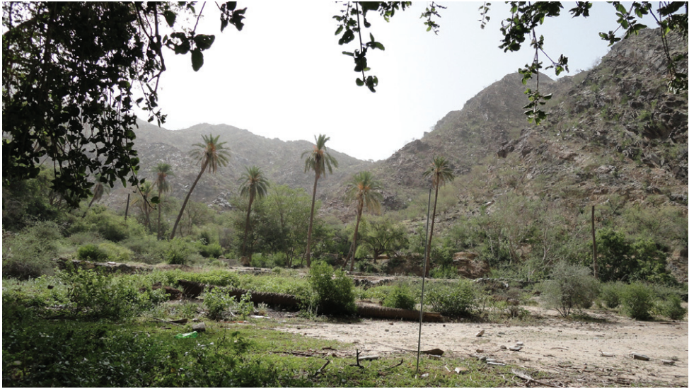
Figure 13. Type locality, Al Mukhwah, Zei Ein Archaeological village.

with 4-toothed mandibles is O. jeanneli Santschi, 1913. This has minor, TL 0.9 mm; metanotal groove shallow, dorsum of propodeum short; petiole noticeably narrower than postpetiole, postpetiole wider than long; head smooth, feebly punctuate, shiny; eyes atrophied set at anterior third of side; scape reaches posterior third of the head; petiole wider than high; postpetiole transverse, twice as wide as long; promesonotum wider than long; dorsum of propodeum wider than long unarmed; yellow, smooth and shiny.