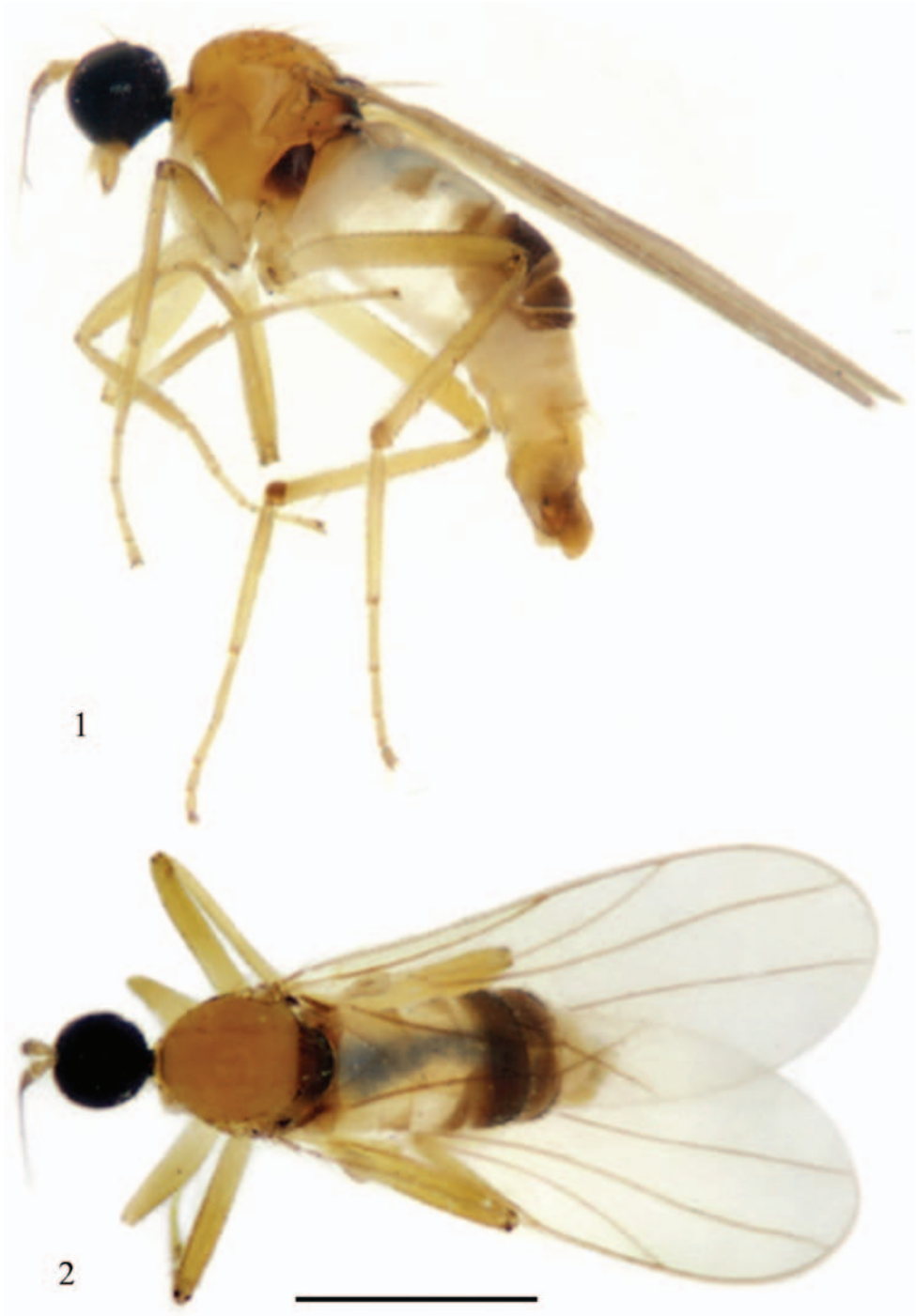
Figures 1–2. Elaphropeza flaviscutum sp. n. 1 adult, lateral view 2 adult, dorsal view. Scale bar 1 mm.