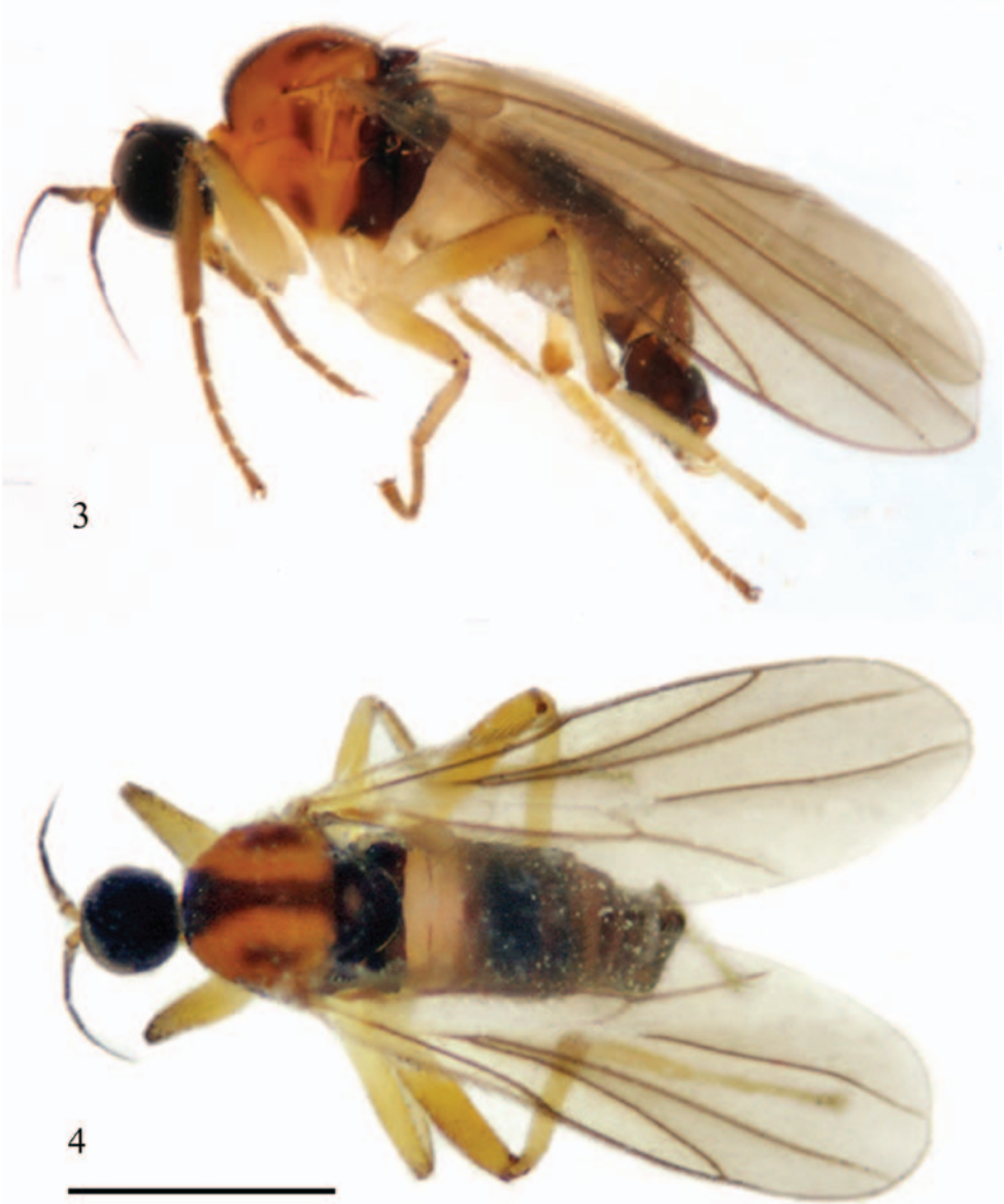
Figures 3–4. Elaphropeza trimacula sp. n. 3 adult, lateral view 4 adult, dorsal view. Scale bar 1 mm.

Abdomen dark brown with thin pale gray pollinosity; tergites complete except tergite 1 linear; tergite 3 relatively board, blackish; hypopygium blackish. Setulae and setae on abdomen blackish except tergites 3–5 each with group of short squamiform black setae laterally, tergite 7 with row of long setae at posterior margin.