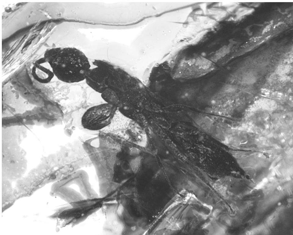
Fig. 1. Photomicrograph of holotype female of Sclerogibbodes embioleia (AMNH), new genus and species.

doubtedly present in the earliest Cretaceous as well. The exploration of amber deposits throughout the world is imperative for additional material of this family. The hosts of sclerogibbids (i.e., Embiodea) are similarly rare in the fossil record. Webspinner fossils have been recovered from the mid-Cretaceous amber of Myanmar (Cockerell, 1919; Davis, 1939; Grimaldi et al., 2002; Engel and Grimaldi, 2006), Eocene Baltic amber (e.g., Ross, 1956), Miocene Dominican amber (Szumik, 1994, 1998), as well as a compression fossil from the Eocene-Oligocene boundary of Florissant, Colorado (Cockerell, 1908; Ross, 1984). As discussed elsewhere the mid-Cretaceous Embiodea are not basal members of the order and the origin and radiation of the group must have been significantly earlier (Grimaldi et al., 2002; Engel and Grimaldi, 2006). The embiodeans in Burmese amber have swollen proboscitarsi, indicating that the mid-Cretaceous is a minimal age for the habit of constructing silken galleries. In lieu of