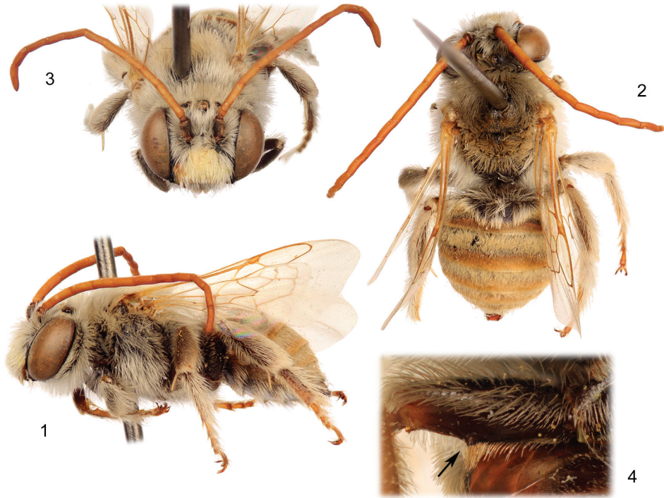
Figures 1–4. Male of Tetraloniella persiciformis sp. n. 1 Lateral habitus 2 Dorsal habitus 3 Facial view 4 Metafemur, with medioventral tubercle (arrow).

2011], M.A. Hannan // at flowers of Pulicaria undulata (PPDM); 1♂, Qatar, Al Sin-nah, 14.ix.1979 [14 September 1979], C.G. Roche (SEMC).