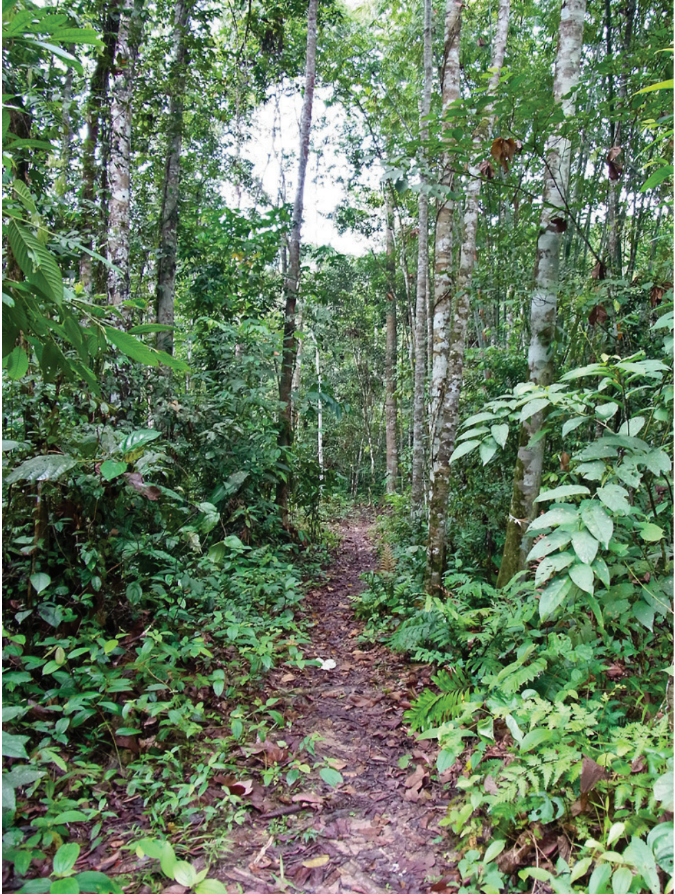
Figure 4. Type locality of Semachrysa jade sp. n., closed forest, 0.8 km SSW of entrance of Selangor State Park, Selangor, Malaysia (GPS: 3.3057,101.693). Photographer: Guek Hock Ping.

pale green, forewing costal crossveins dark anteriorly on crossveins 1–3 and posteriorly on crossveins 8–10; basal subcostal crossvein dark; membrane infusate and venation dark in medial area of both wings from R vein to posterior margin, markings darker