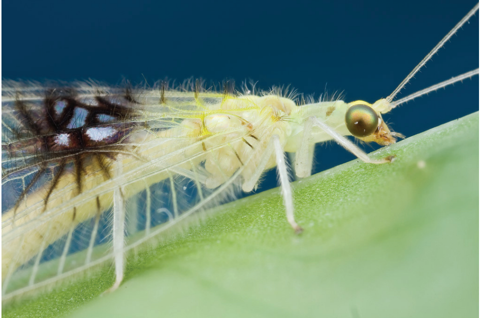
Figure 3. Semachrysa jade sp. n. female habitus (Morphbank: 791597). Forewing length: 15.0 mm.