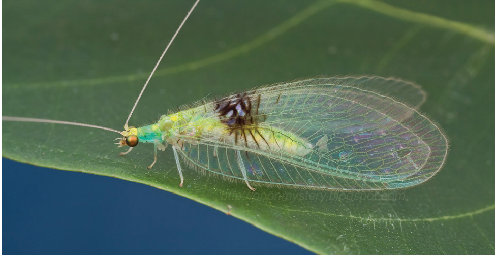
Figure 1. Semachrysa jade sp. n., female holotype habitus (Morphbank: 791595). Forewing length: 15.0 mm.