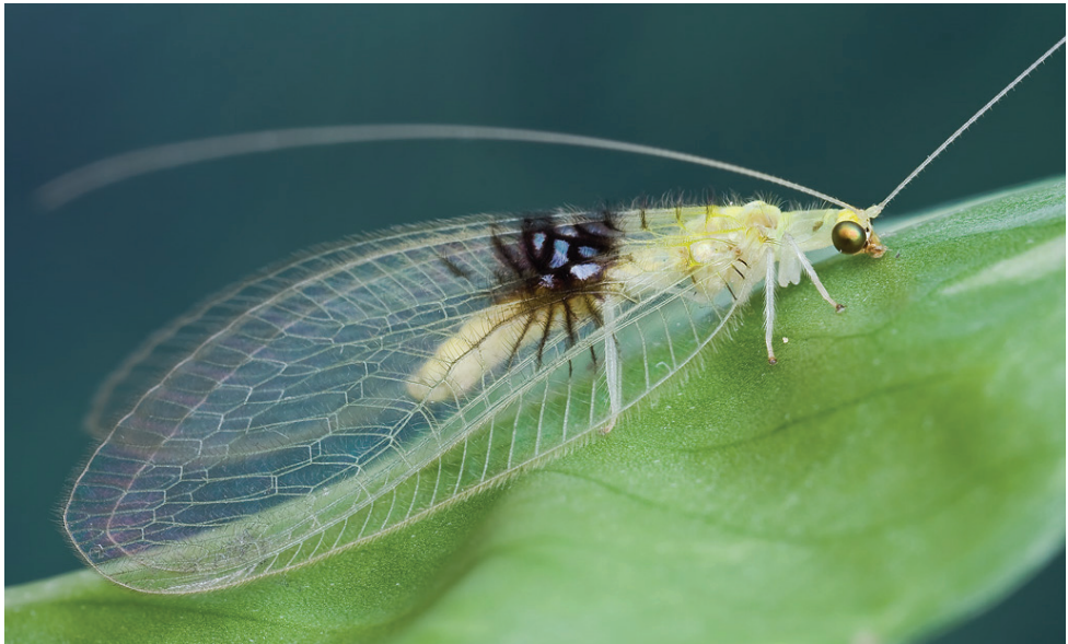
Figure 2. Semachrysa jade sp. n. female habitus, specimen that was originally photographed and released (Morphbank: 791596). Forewing length: 15.0 mm.

posteriorly, Rs closely approximating Psm basally; three crossveins between Cu1 and Cu2, 1st posterior marginal crossvein forked with posterior arm joining to Cu2 petiolate to margin; two dark spots across frons below antennae; single marking between antennal bases; dark markings medially on abdominal tergites 2–4; sternite seven with acuminate posteromedial margin with tuft of short dark setae.