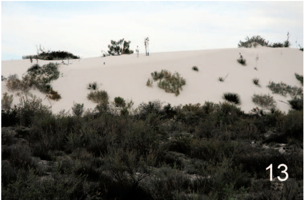
Figure 13. White dune habitat of type locality of Schinia poguei .

White Sands National Monument preserves 284.9 km 2 (110 square miles), or about 40%, of the world's largest snow-white gypsum dune field. The remainder of the 275 square miles dune field is under the jurisdiction of the U.S. Army in the White Sands Missile Range. The dune field is located in the northern Chihuahuan Desert in southern New Mexico's Tularosa Basin (Schneider-Hector 1993). In 1950 Stroud