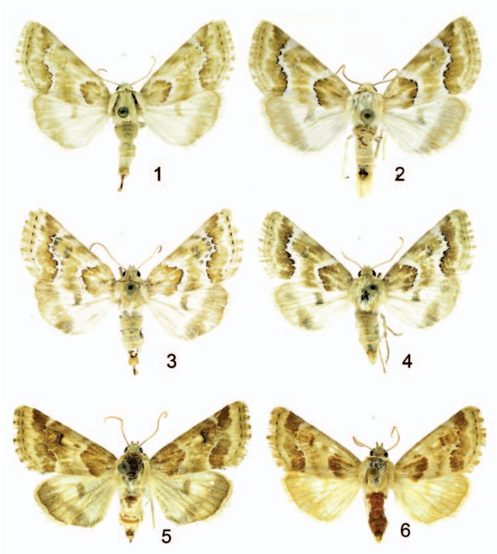
Figures 1–6. Schinia adults. 1 S. poguei Metzler & Forbes, female holotype 2 S. poguei Metzler & Forbes, male paratype 3 S. poguei Metzler & Forbes, female paratype 4 Schinia poguei Metzler & Forbes, male paratype 5 S. walsinghami Grote, female 6 S. walsinghami Grote, male.

4,008', 10 Oct[ober]. 2010, WsnmF, Eric H. Metzler, uv tr[a]p, Accss #: WHSA - 00131" "HOLOTYPE USNM Schinia poguei Metzler & Forbes" [red handwritten label] (USNM). Paratypes: 290 males and 107 females: NM: Otero Co. White Sands Nat[ional] Mon[ument] (hereafter WSNM) same data as Holotype. USA: NM: Otero Co. White Sands Nat[ional] Mon[ument], interdune habitat, 106°10.84'W, 32°46.64'N, 4,008', 4 Oct[ober]. 2010, WsnmF, Eric H. Metzler, uv tr[a]p, Accss #: WHSA - 00131 USA: NM: Otero Co. WSNM, interdune habitat, 106°11.49'W, 32°45.60'N, 4,000', 14 Sept[ember] 2009, WSNMB, Eric H. Metzler, uv tr[a]p, Ac-