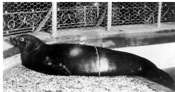
FIG. 1. Captive Monachus tropicalis of unknown sex at the New York Aquarium in ca. 1910. Specimen originally captured from either Arrecifés Triángulos (Campeche) or Arrecife Alacrán (Yucatan) in Mexico (Townsend 1909).

Adult pelage, which lacks underfur, is dark dorsally and grades into a lighter countershade ventrally. Dorsal fur is variable in color, being brown, sepia, black, dark blackish-brown, or dark gray, and often appears grizzled due to distal tips of hair shafts being gray or yellow. Ventral fur ranges from pale yellow to yellowish-gray or yellowish-brown and is sometimes mottled with darker patches. Front and sides of muzzle and edge of full and fleshy lips are yellowish-white. Limbs are of a similar color to the dorsum (Allen 1887a; Fernández de Oviedo 1944; Gaumer 1917; Goodwin 1946; Gosse 1851; Hill 1843; King 1956; True and Lucas 1886;