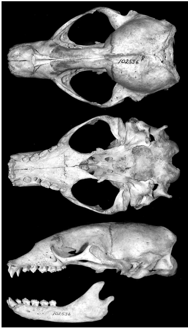
FIG. 2. Dorsal, ventral, and lateral view of skull and lateral view of mandible of an adult female Monachus tropicalis collected at the Arrecifés Triángulos (Campeche, Mexico) on 23 June 1900 by E. A. Goldman and E. W. Nelson (National Museum of Natural History, USNM 102536). Right P2 is missing. Condylbasal length is 258 mm.

Ward 1887). Older adults tend to be lighter in color, with more gray, and sometimes a dusky-colored muzzle (Allen 1887a). Females are reported to be more uniform than males in color, with less white or yellow ventrally (Gaumer 1917; King 1956), but Allen (1887a) notes no perceptible sexual differences.