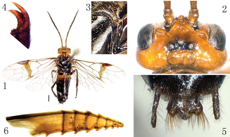
Figures 1–6. A. bicoloricornis sp. n., holotype 1 Adult female, dorsal view (scale bar = 1mm) 2 Head, dorsal view 3 Prepectus, epicnemium and dorsal part of mesepisternum 4 Claw 5 Cerci and apical sheath, dorsal view 6 Lancet

legs black, tibia and tarsus of fore leg yellow brown. Wings hyaline, vein C except for both ends pale brown, other veins and pterostigma black brown, anterior breadth of sharply defined smoky macula on forewing about half length of pterostigma. Body hairs brown.