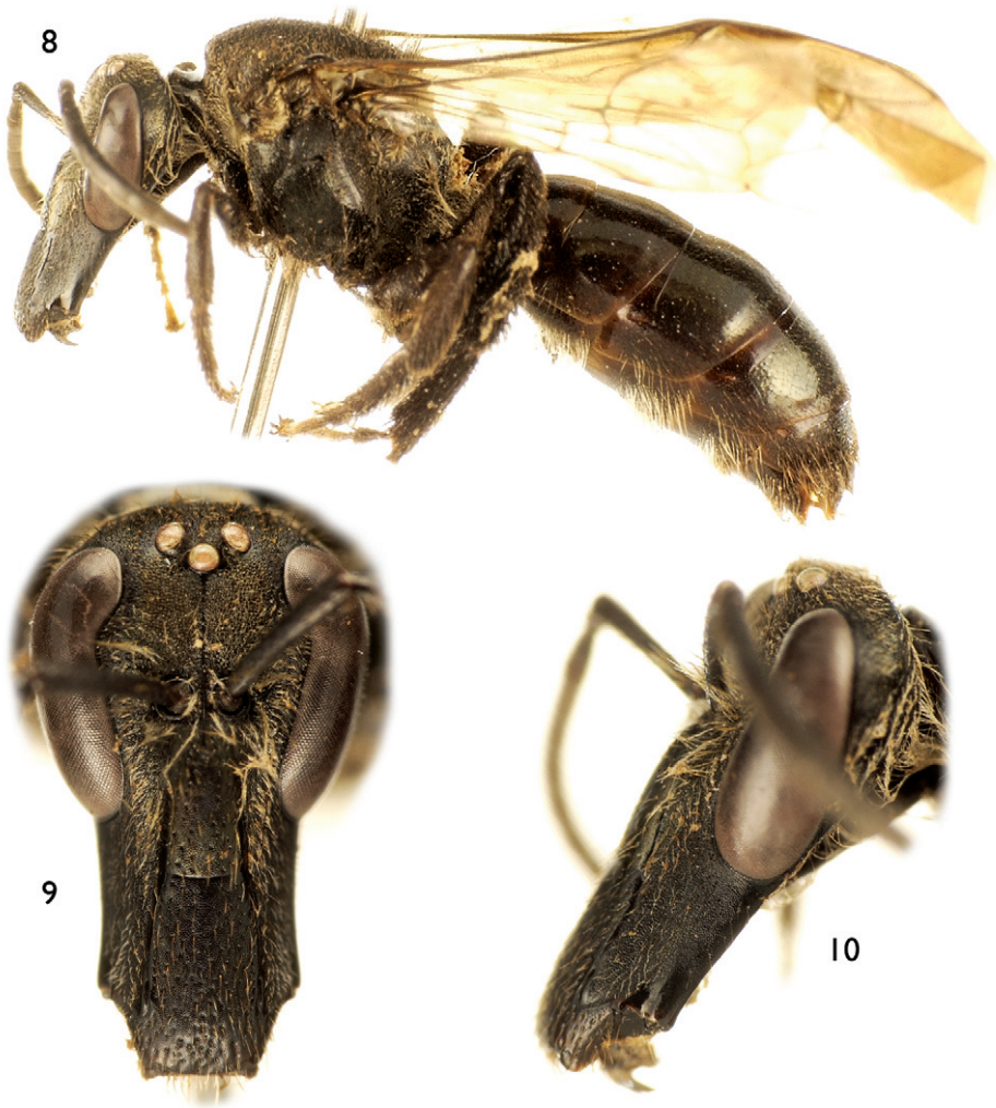
Figures 8–10. Paratype female (AMNH) of Chlerogas aterrimus sp. n. 8 Lateral habitus 9 Facial aspect 10 Lateral aspect of head.

branches, not including apical portion of rachis. Metasomal sternum IV apically with paramedial patches of dense golden setae; metasomal sternum V gently concave medially, with distinct, pale gold setae fringing apical borders except in medial concavity; metasomal sternum VI deeply concave medially, with dark gold to fuscous setae except medially along inner and proximal border of concavity; hidden sterna and genitalia as in figures 4–7.