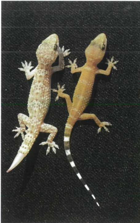
2a 2b 2c 2d