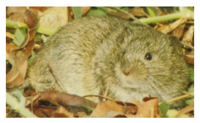
FIG. 1. Photograph of an adult Microtus montanus .